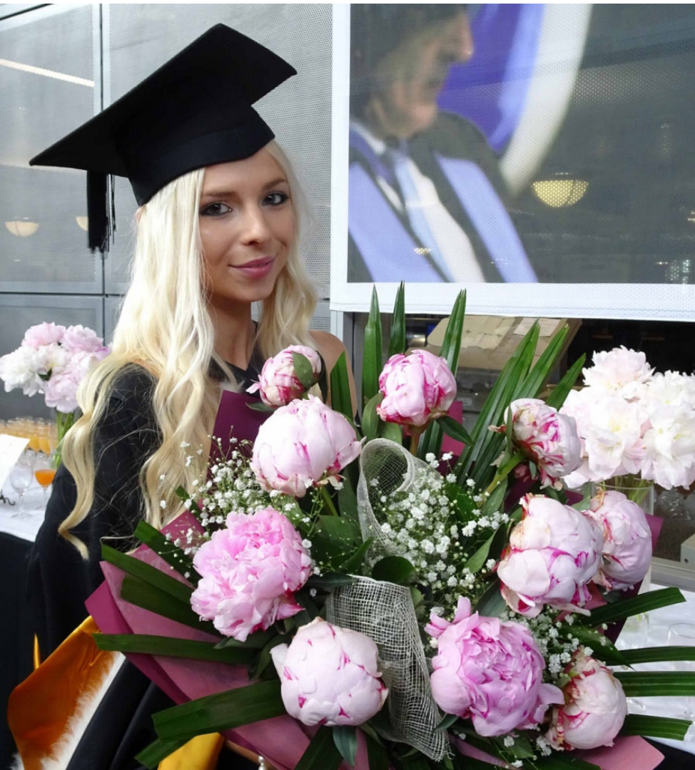
We took more than one hundred photos of December 2015 graduates on their special day. You can check out more photos on our Otago Alumni Facebook page .

If you are in one of those photos and would like a high resolution copy, please contact us. We take your privacy extremely seriously: We will require proof the photo is going to its owner before sending the high resolution photos via email.