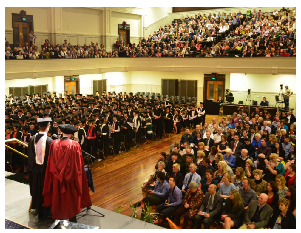
Photo courtesy of McRobie Studios, who take the graduation ceremony photos at each graduation.